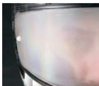
An untreated visor mists like this...

The Foggy mask misses out on a RiDE triangle as it's awkward for spectacle wearers, while the Bob Heath Fog Demon is fiddly to fit.