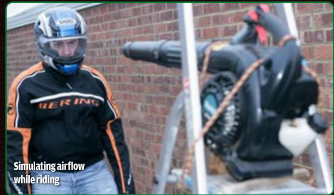
Simulating airflow while riding

The outside ambient temperature was noted at the start and end of every product's test, ensuring the same temperature throughout. The tester wore a winter jacket and neck-tube before putting the helmet on and we checked each product's claims by breathing out heavily, five times. If misting occurred, we noted how badly (see the results on the pictures with each product's write-up). We tested each product in still air at 3°C, and in front of a leaf-blower, used to simulate airflow around a helmet when on