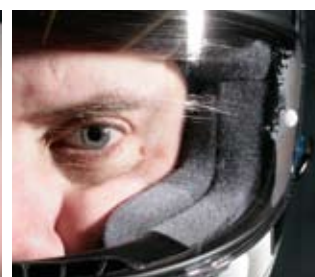
...but test winner Fog Tech clears up